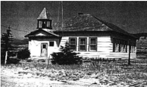
Dayton School 1995